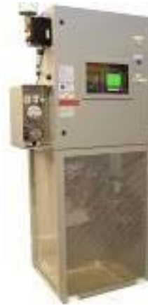
Hydrogen Control Systems