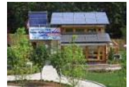
Renewable Energy Storage