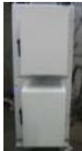
HPEM High Pressure Generators